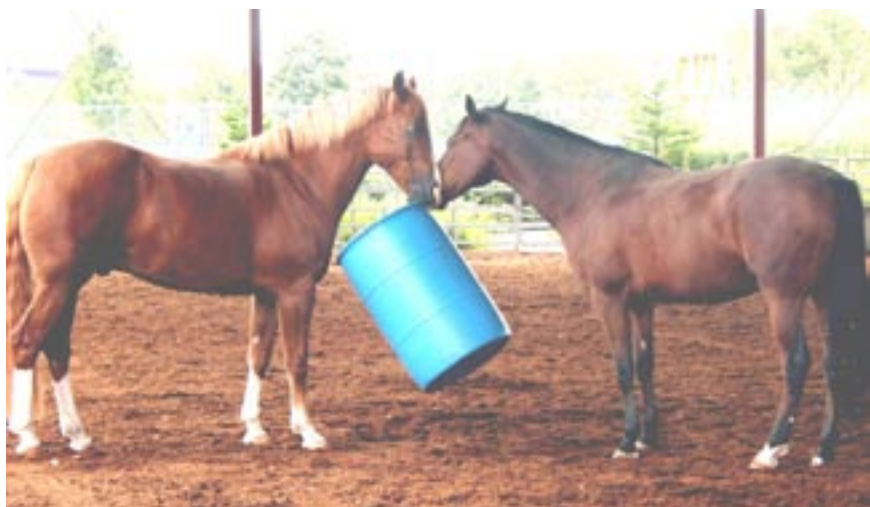
Spud and Ian, both Belgian purebreds, are the latest two additions to the Portland Police Bureau's Mounted Patrol Unit, bringing the total number of horses to nine. If you would like to learn more about the Mounted Patrol Unit and visit Spud, Ian and other mounted patrol officers and horses, contact the Mounted Patrol Unit at 503-823-2100 to set up a tour.

So far, the emails have consisted of crime alerts and notices of meetings and trainings related to public safety in Southwest Portland. Right now, the volume of email on this list serve is only about 3-5 per month. I hope that with more members, the discussion will pick up. I hope to see you on the SW Public Safety List Serve soon!