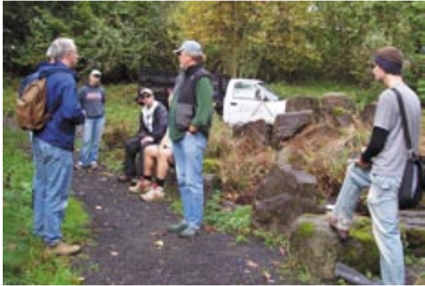
October 2005 volunteer riverbank restoration work crew

Have you wondered about those large pipes running down Naito and Corbett, the pumps at several intersections and all the construction activity in the neighborhood? It's an emergency sewer repair project. A section of a century-old brick sewer collapsed in September. The pumps and pipes are there to pump sewage out above the damaged section and carry it to a manhole below the damaged section until the collapsed pipe is replaced. Portland's Bureau of Environmental Services is designing the repairs. Designs will be done in December and construction will start soon after. Environmental Services will build about 2,400 feet of new sewer pipe to replace the damaged brick sewer. The project could take at least a year. Environmental Services has scheduled a public meeting on Thursday, December 8, 6:30 - 8:30 pm, in the Cedarwood School gymnasium at 3030 SW 2nd Avenue. See page 1 for more info.