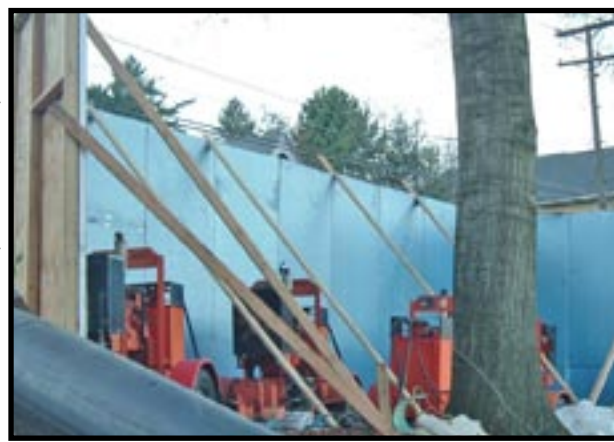
The pumps at SW 1st & Grover will soon be replaced with "quiet pumps" that are on their way from New Jersey.

Environmental Services installed pumps in the project area to bypass the damaged section by pumping water out of the sewer above the collapse and conveying it through above ground pipes to manholes below the damaged section. Installing several pumps at different locations ensures adequate pumping capacity when it