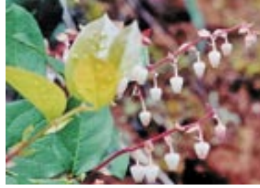
Salal gaultheria shallon